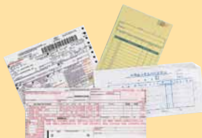
Fragile and thin documents Rice Paper • Airbills • NCR Forms

The Kodak Ngenuity Scanners’ innovative design packs in smart features that make a big impact in helping you spend less time sorting paper, adjusting scanner settings and worrying about image quality, and more time streamlining your document workflow and boosting your bottom line.